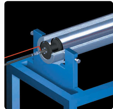
Detector with adapters in the tube.